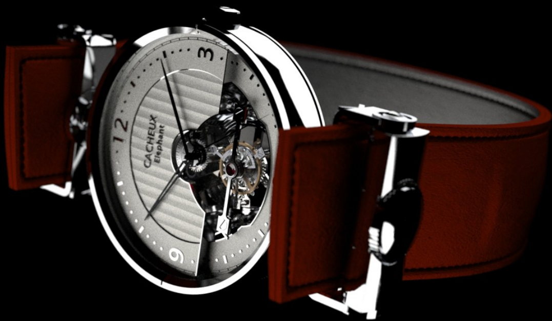
CACHEUX Elephant Tourbillon White gold