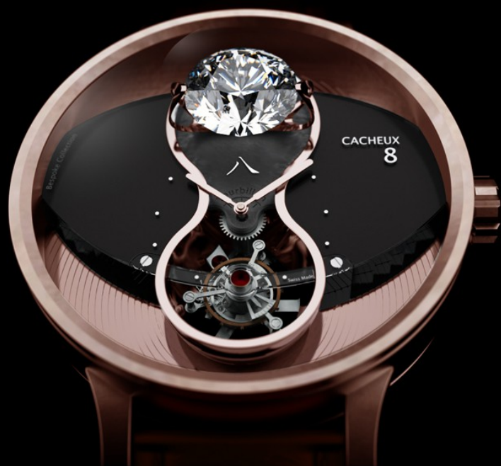
CACHEUX 8 8 carats diamond Rose gold