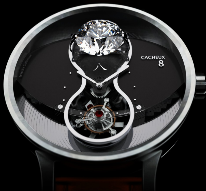
CACHEUX 8 8 carats diamond White gold