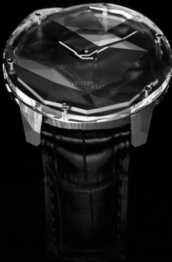
CACHEUX Brut White gold