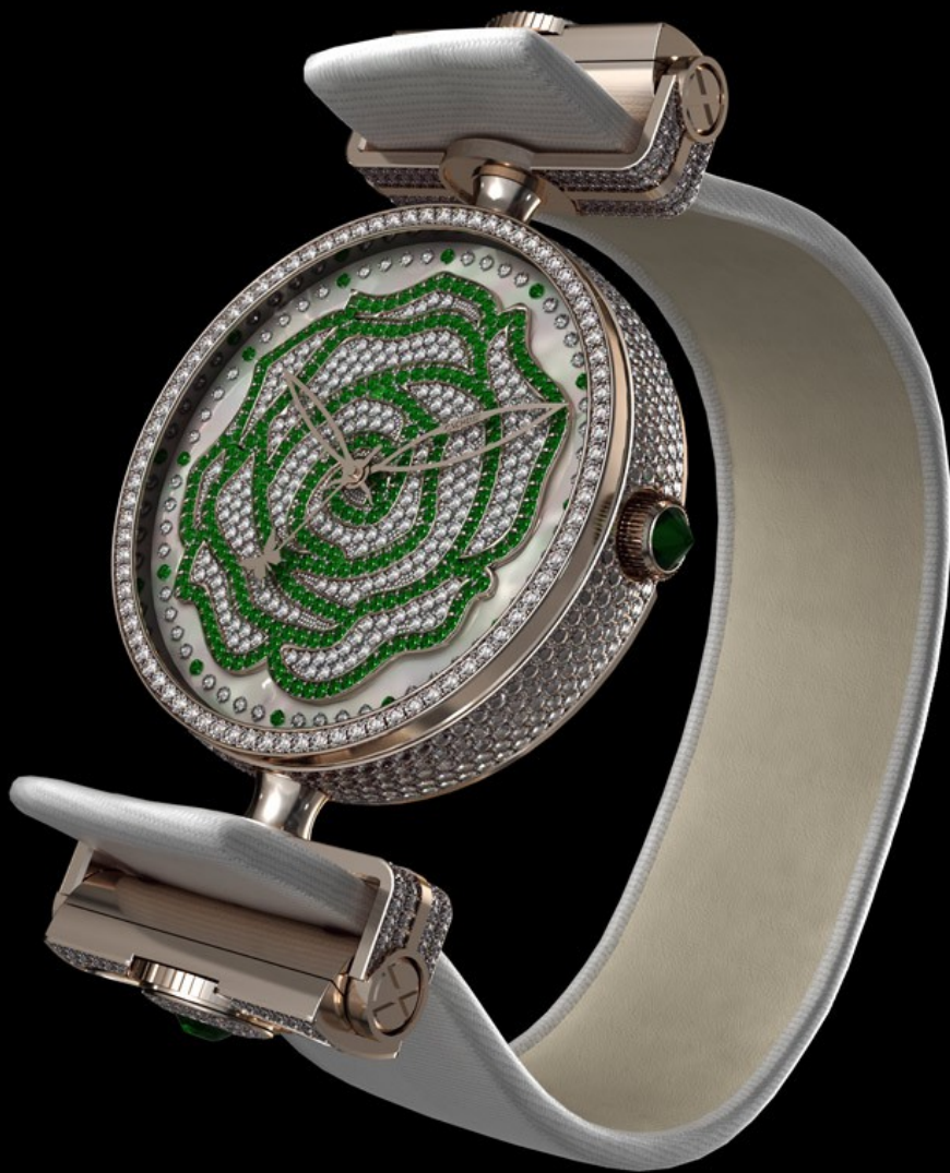
CACHEUX Papillon White gold 30 carats emeralds/diamonds